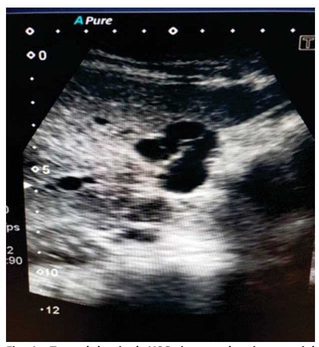
Fig 1: Transabdominal USG image showing partial intrahepatic Gallbladder. Few internal septations can be seen in the intrahepatic part

Considering the rarity of its incidence and the unusual location, the intrahepatic gallbladders may pose a diagnostic challenge and may complicate surgical interventions. Thus, making it mandatory for the surgeon to know the ectopic location beforehand to avoid any intraoperative mishaps.